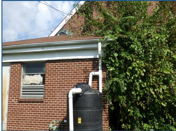
Figure 2. Cistern at St. Joan of Arc Church site

These cistern tanks as shown in Figure 2, are made of resins that meet FDA specification to ensure safe water storage. The black color limits light penetration to reduce the growth of water borne algae. The monitored cisterns are installed near vegetable gardens to provide irrigation water. These cisterns capture roof runoff through the downspout from adjacent buildings. At some sites no building existed, therefore, a shade structure was constructed to supply roof runoff to the cistern tank. If it rains while the cistern is full, the cistern overflows. Near the bottom of each tank a spigot and a hose was installed so that the water can be used. At two sites, a pump was installed with the spigot that helped to draw the water from the tank.