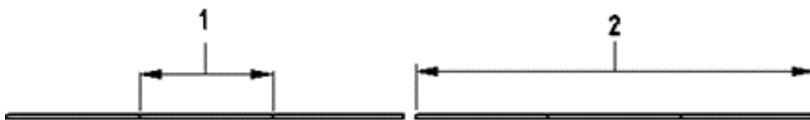
Figure 1 — Double leaf telescopic door